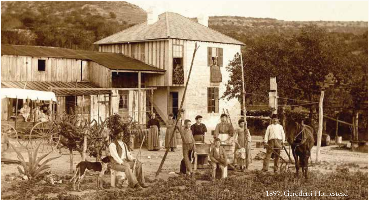
1897, Gerodetti Homestead

Nestled in the romantic Texas Hill Country, sits the small Polly, Texas settlement. Its located 3.5 miles southeast of Bandera, Texas and thirty minutes from San Antonio. J.P. 'Polly' Rodriguez founded the settlement in 1858. He was a famous Army Scout, Surveyor, Texas Ranger, Rancher, Judge and Minister. It consisted of 30 Tejano ranching families along with several European settlers. The settlement included Polly's Fort, Schoolhouse, General Store, Post Office and Chapel. It is one of a few historical Tejano towns still remaining in Texas. It has gone unrecognized for its part in early Texas history.