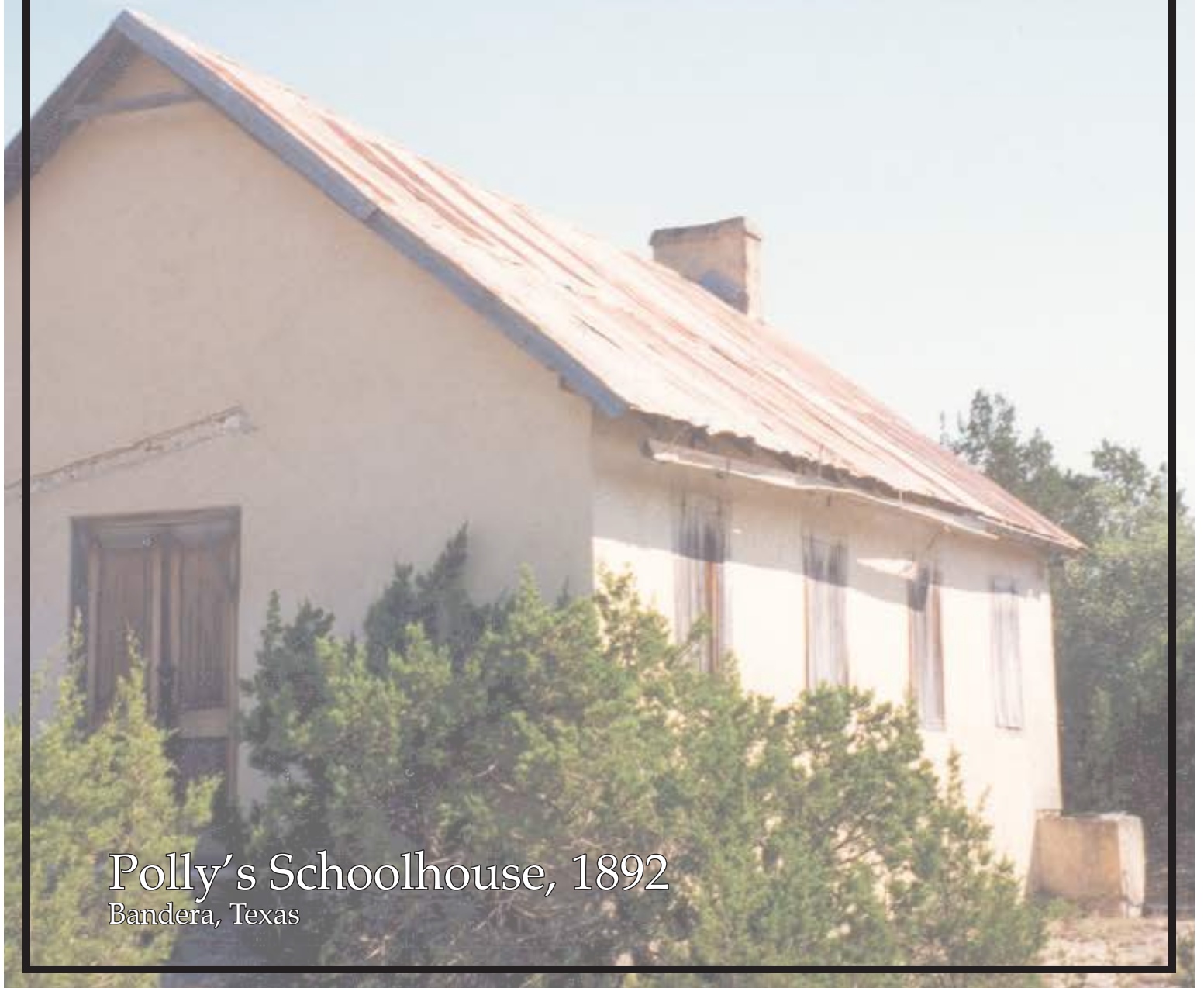
Polly's Schoolhouse, 1892 Bandera, Texas