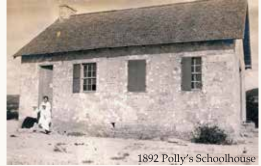
1892 Polly's Schoolhouse

The Polly Texas Pioneer Association is a non-profit 501.c.3 organization dedicated to preserving the history and heritage of the historic settlement of Polly, Texas in southeast Bandera County. Founded by our namesake, this village is one of the last historical Tejano towns still remaining in Texas.